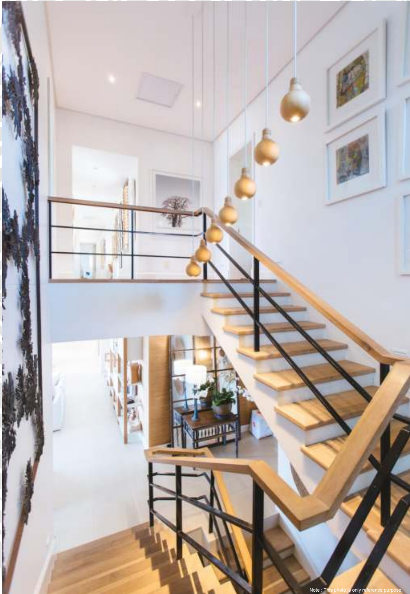
Note : This photo is only reference purpose.