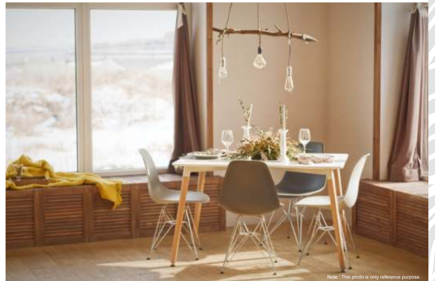
Note : This photo is only reference purpose.

Each house at Brookside Valley is created for connoisseur. Sustainable Passive Villa is designed to minimize its environmental impact while promoting a healthier lifestyle with seamless convenience. At Brookside Valley, we reconnect with and appreciate the natural world.